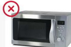
No large electronics or appliances