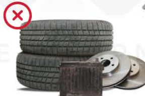
No automobile waste (including car parts, tires and batteries)