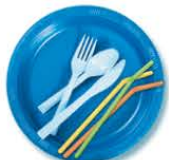
Plastic plates, cutlery and straws