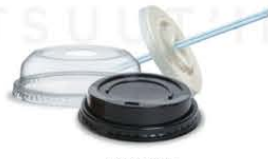
Drink lids Even if it has a recycling symbol.