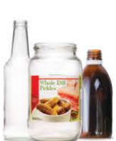
Containers made of glass - Food jars and bottles

Containers such as jugs, bottles, cartons, cans and other rigid containers.