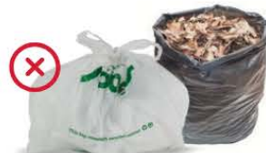
No plastic or biodegradable bags If using a bag to line your kitchen pail, only use certified compostable bags

By keeping these items out of your green cart, you're doing your part to ensure we can produce the highest quality compost possible that will be used at local farms, gardens and in your community.