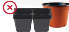
No plant pots or bedding trays Separate plants and soil from container before composting.