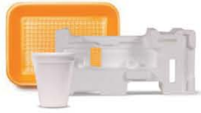
Foam containers or foam packaging Even if it has a recycling symbol.