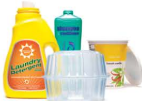
Containers made of plastic Labeled with recycling symbols 1-7.