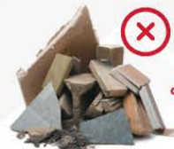
No large quantities of construction or building materials