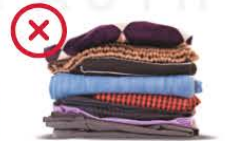
No clothing, pillows or fabrics

Organic / Compost material and or bags left outside the bin will NOT be collected