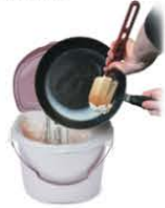
Cooking oil, sauces and grease

Tip: Use a paper towel to soak up any fats, oils or grease and put it in your green cart too.