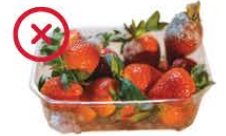
No food in packaging Separate food scraps from container before composting