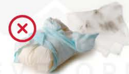
No diapers or wipes (even if they say compostable)