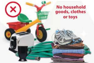
No household goods, clothes or toys