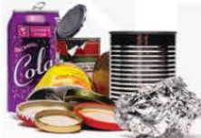
Containers made of tin - Food cans and tin foil