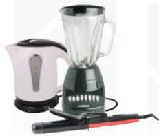
Small broken appliances