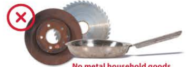
No metal household goods

No household hazardous waste If an item has a hazard symbol, then it must be taken to a Household Hazardous Waste Drop-off, even if it's empty.