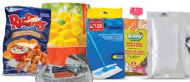
Mixed packaging and non-stretchy bags Even if it has a recycling symbol.

After reusing, composting and recycling, you will easily cut your garbage in half. Only items that have reached the end of their useful life should go in the garbage.