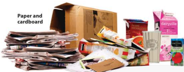
Paper and cardboard

See special instructions below for items such as shredded paper and bundled plastic bags .