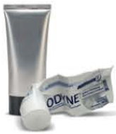
Lotion and toothpaste tubes