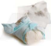
Used diapers and wipes