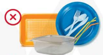
No foam, plastic packaging, plates or cutlery (even if they say compostable)