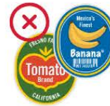
No fruit or vegetable stickers