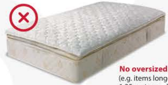
No oversized items (e.g. items longer than 1.25 metres or heavier than 20 kilograms).

If an item has a hazard symbol, then it must be taken to a Household Hazardous Waste Drop-off, even if it's empty. Find locations at calgary.ca/hhw