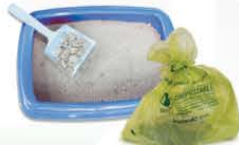
Pet waste and kitty litter (all varieties)

Put in a certified compostable bag or paper bag and tie/roll closed.