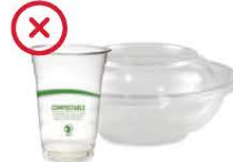
No compostable plastic packaging or containers